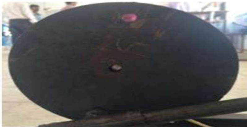
Fig. b) Cam

A cam is a projecting part of a rotating wheel or shaft that strikes a lever at one or more points on its circular path. The use of cam in our project is to convert the rotary motion into linear or reciprocating motion with the help of connecting rod which connects the cam and hydraulic jack so that the jack would get lift with ease by simply pressing button.