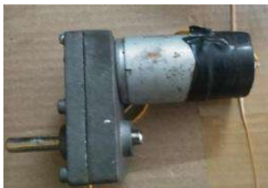
Fig. c) Hydraulic Motor

A machine which is used to convert direct current power into mechanical power is known as D.C Motor. Its generation is based on the principle that when a current carrying conductor is placed in a magnetic field, the conductor receives a mechanical force. In our project is 12 volt 60 rpm gear motor is used to give the rotary motion to cam which will convert into reciprocating motion of hydraulic jack.